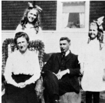
from Saddles, Sleighs & Sadirons copyright Chestermere Historical Society 1971