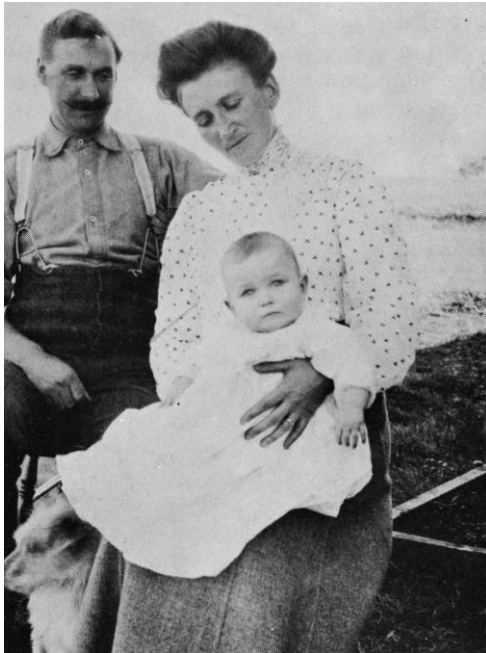
from Saddles, Sleighs & Sadirons